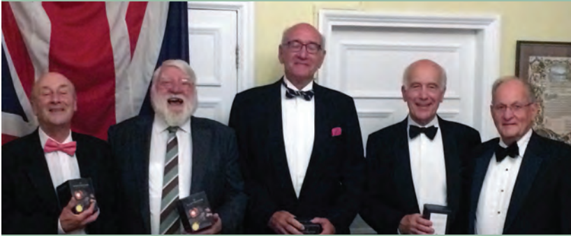
Monmouth School in Hong Kong