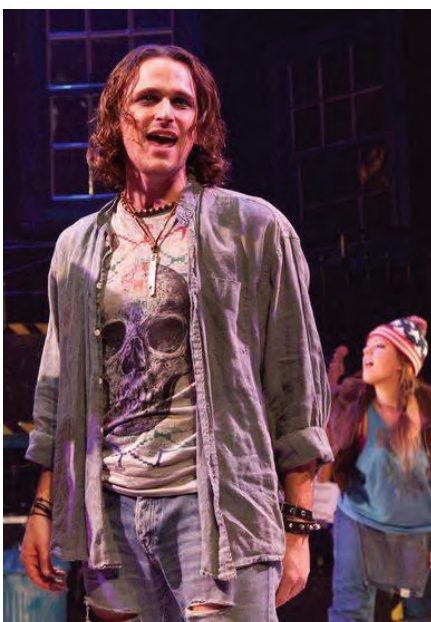
Rent , production shot

Contacts: @EdHandoll www.edwardhandoll.co.uk