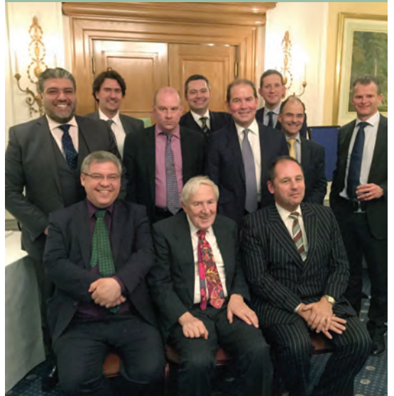
Joint Christmas drinks at the Royal Overseas League, London