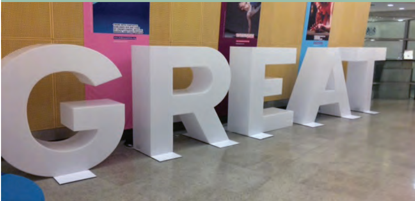
Independent Schools Show