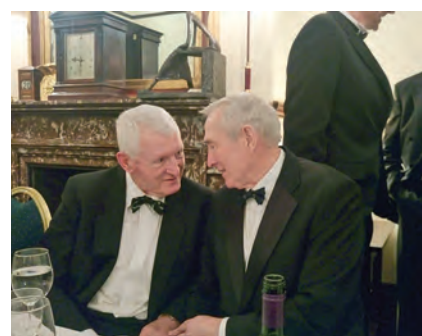
The Cardiff Dinner

London Dinner , Friday 17th at Habs' Hall, London. Open to OMs only. Price £55 per person. Contact stevenorris@hotmail.co.uk